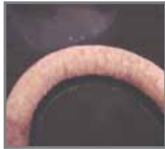
Leave a wrinkle...