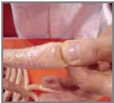
Use flats of fingers...

To begin, pinch the strand with the pads of your finger and thumb. Make a space for the first twists. Don't use your nails as this will tear the casings.