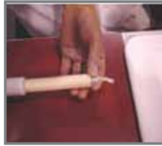
Thumb & finger control...

Slightly under fill the casing leaving enough room for the meat to move in the casing and give a good appearance.