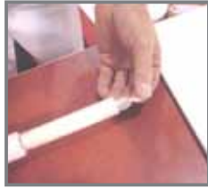
Close the end...