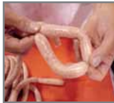
Form the loop...

Only twist the skin, not the skin and the meat. Continue forming the links in this easy simple way.