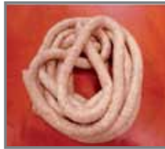
Make it even...

Once the strand is filled, linking is a similar step to the standard procedure.