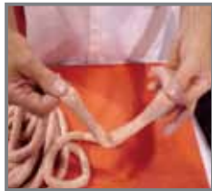
Make a space...