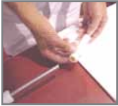
Clear, open end first...